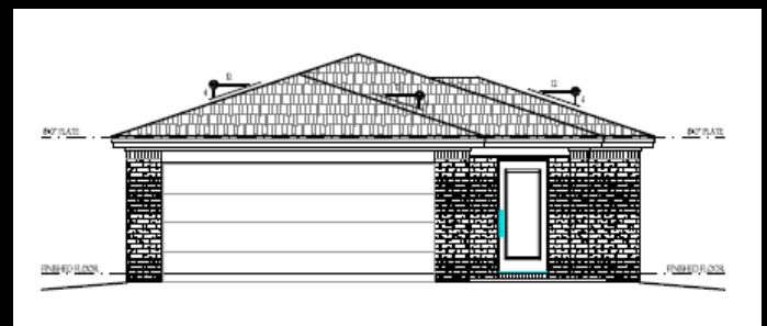
Proposed Single-Family Design